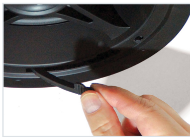
Unique, patented clamp system allows for easy installation and removal.